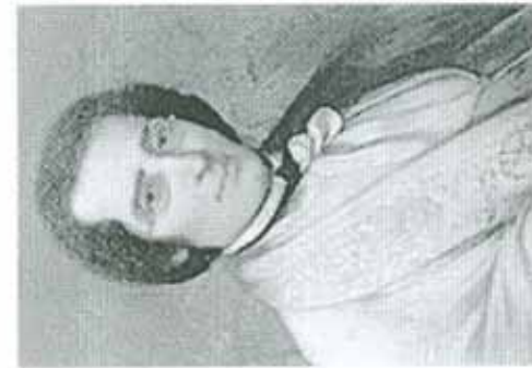
Father Felix Varela (1788-1853)